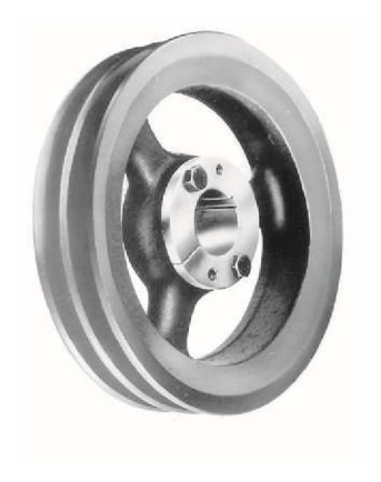
Double Groove Sheave